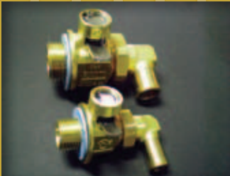
L-Shaped Valves The elbow joint, which accepts hose, is removable and rotates 360° (limited selection)