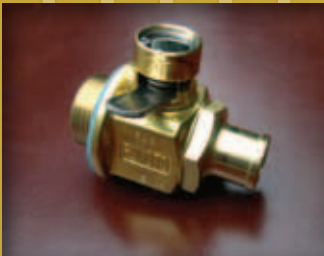
N-Series Valve (Nipple type) accepts hose, allows oil to be drained away from the engine