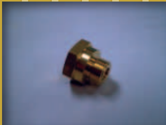
Round Adapter Extends the length of the valve, used in recessed oil plug type pans