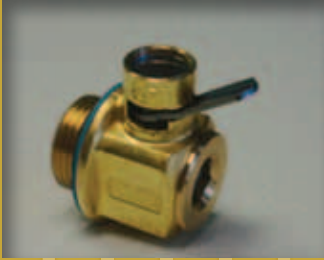
Standard EZ Oil Drain Valve Our most popular!